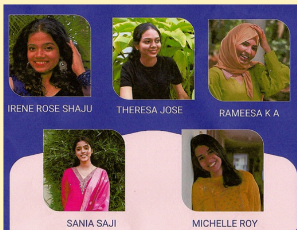
Winners of the KUHS Merit Scholarship of ₹10,000/-