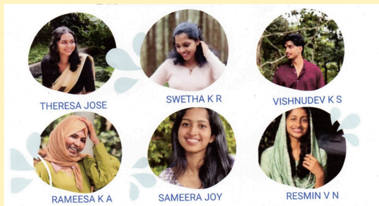
Winners of YIP 8.0 at the district level, eligible for ₹25,000/-.