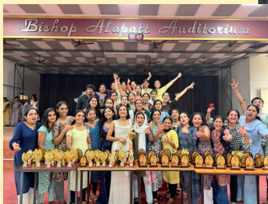
Overall Champions "Ektharaz"